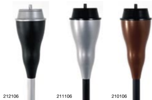
Colours available - Aluminium pole