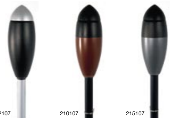
Colours available - Aluminium pole