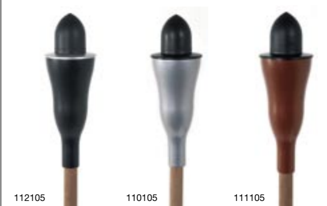
Colours available - Wooden pole

Pipe-Line Denmark holds more patents which ensure the end-user unique design and functionality in long-lasting torches and lamps of exceptional high standard.